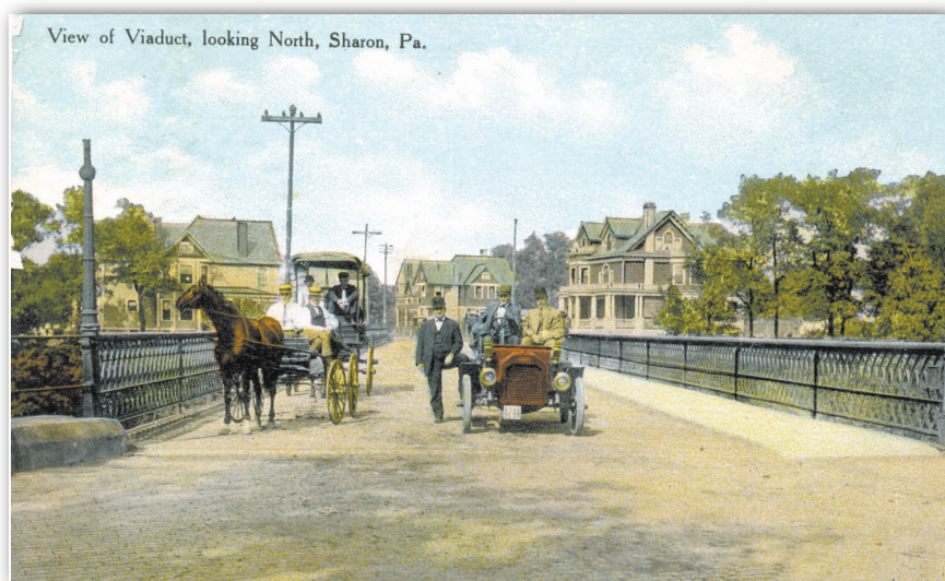
Occupants of two horse-drawn carriages and a motorcar pose at the south end of the then-Hazel Street viaduct in Sharon sometime shortly after 1907. Note that the houses on both sides of the north end still stand.

The road below – which began as the two-lane Pine Hollow Boulevard in the 1930s – traces the railbed of the Sharon and Greenfield Railroad. The railroad, established in 1870, hauled coal to the Erie Extension Canal basin at Dock Street in Sharon, just beyond where the cows grazed.